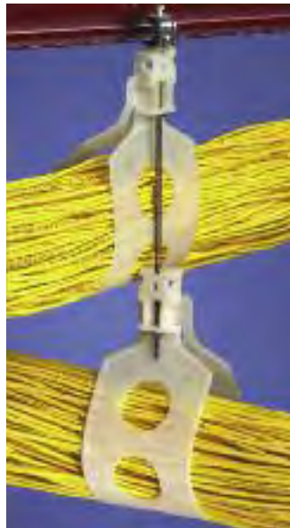
MULTIPLE LOOP HANGERS Stacked, perpendicular mounting on 1/4" rod