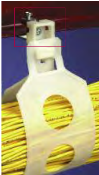
SINGLE LOOP Parallel mounting on 1/4" beam clamp