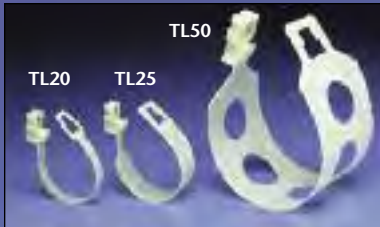
TL50 patented for a 5" cable bundle

Flexible and non-metallic, The LOOP ® provides sturdy, reliable support of CAT 5, 6 or 7 – or fiber optic cable without sagging, bending or damaging the cable! The LOOP holds up to a 5" diameter bundle of cable.