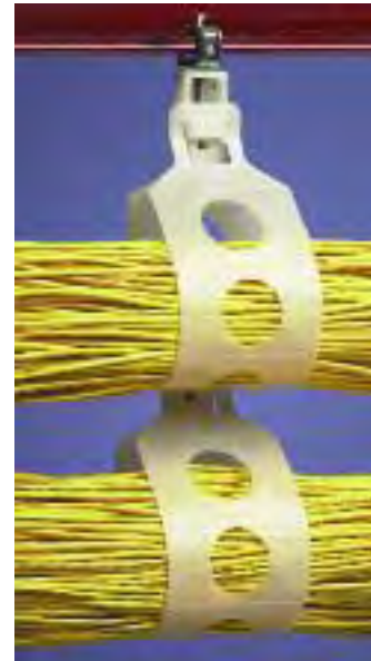
MULTIPLE LOOP HANGERS Stacked, parallel mounting on 1/4" rod